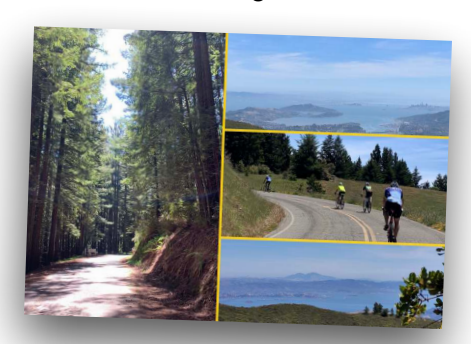
Redwood forest, San Francisco, and Mt. Diablo from Mt. Tamalpais.

rides in the Bay Area from time to time. These rides offer members of different riding skills with the chance to enjoy the unparalleled beauty of our area on their bikes. This